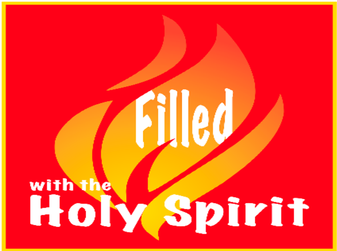
Image: "Come, Holy Spirit, fill the hearts of the faithful, and kindle in them the fire of Your love." (Verse for Pentecost Day)