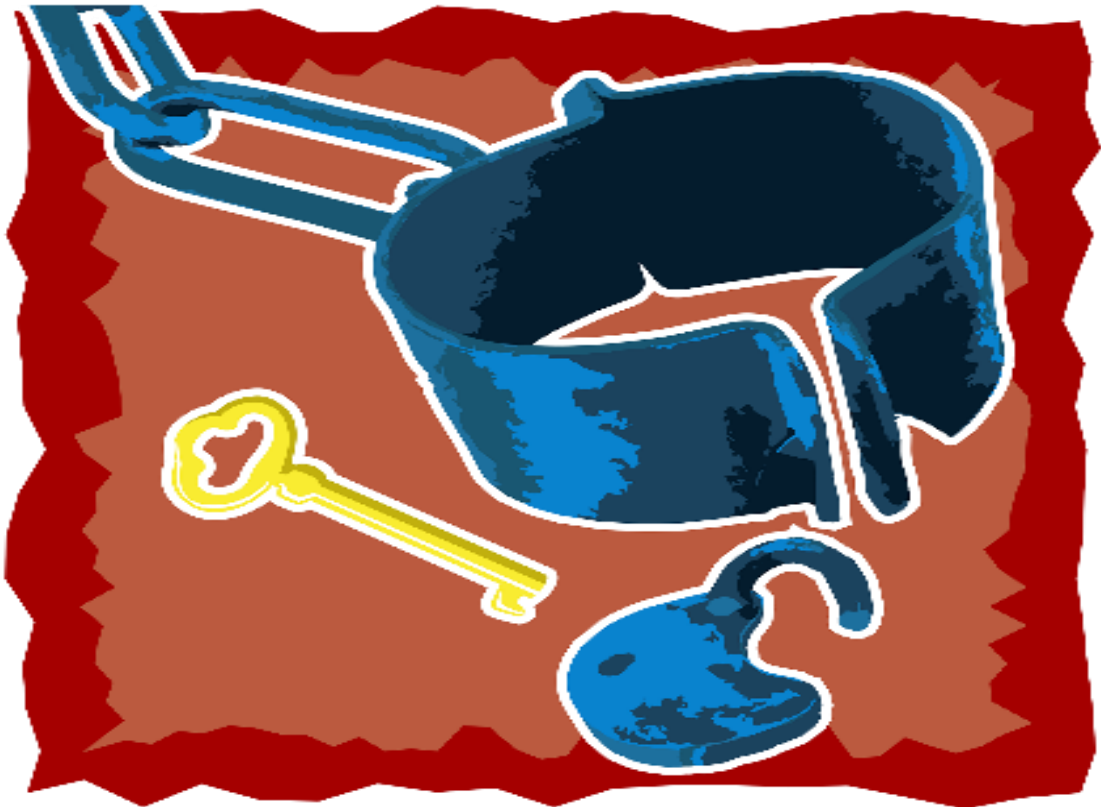
Image: "We are released from the law, having died to that which held us captive, so that we serve not under the old written code but in the new life of the Spirit." ( Romans 7:6 )